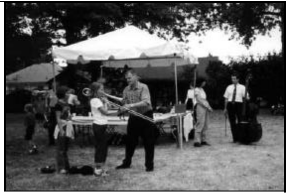
Oregon Symphony "Petting" Zoo

We hope everyone who came to the event had a wonderful day. And we hope to see you at our General Meeting on October 8th, 7 p.m. at Grace Lutheran Church on 76th & Fremont. Support of your neighborhood will ensure that this type of activity will continue, and even more good things will come our way. Also, please visit our web site at http://groups.yahoo.com/group/rosewayneighborhoodassn/ . It's new, so be patient as we develop it to bring you news of your neighborhood."